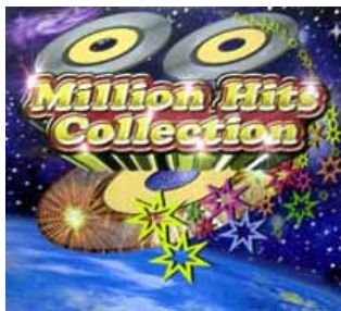
2003 Japanese release 16 CD Compilation