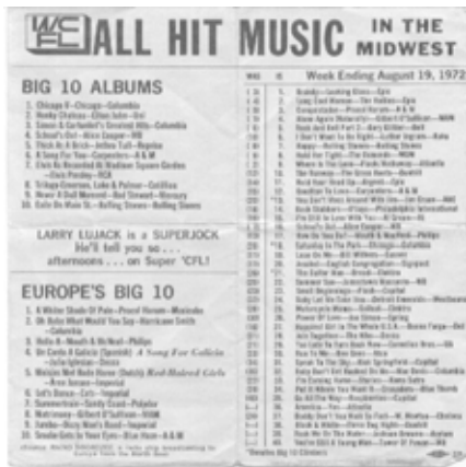
Summer Sun #22 in Chicago