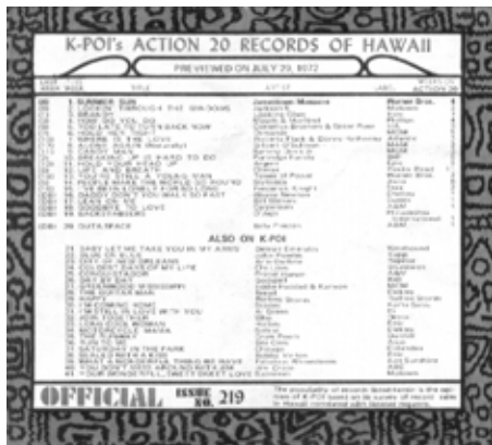
Summer Sun # 1 in Hawaii